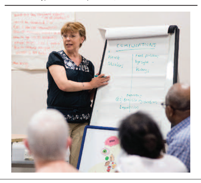
Figure 3. A session of Diabetes Education and Self Management for Ongoing and Newly Diagnosed type 2 diabetes patients (DESMOND)

Practices know that they can call the team (or increasingly email a team member) if they require advice, whether urgent or routine.