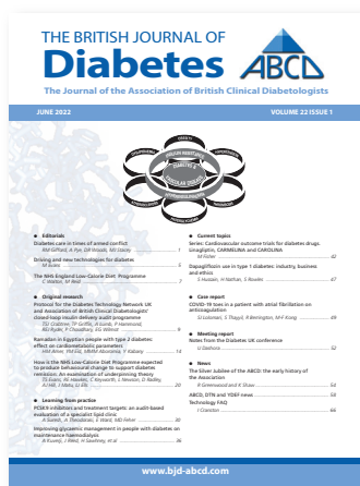
Figure 4. British Journal of Diabetes : current front cover design.